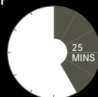
From Heathrow Airport