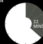
From London Waterloo to Weybridge Station